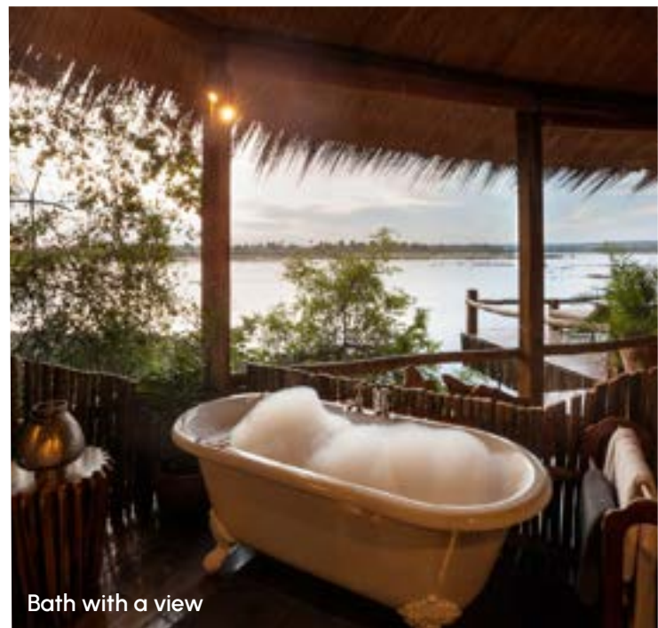
Bath with a view