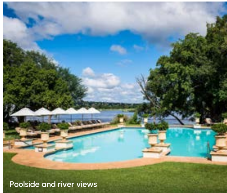
Poolside and river views

The spectacular scenery includes a view of zebra, giraffe and impala grazing in the lush gardens, an inviting Victorian styled swimming pool overlooking the Zambezi River and a sun-deck located on the river banks, perfect for sipping sundowners in a romantic setting. The hotel's 173 en suite rooms are divided between a series of villas and each room has a private veranda overlooking the river. Unwind in the spa, enjoy a romantic dinner under the stars, dine on superb meals, relax in the bar lounge or take part in one of the famous adventurous activities associated with the Victoria Falls and Zambezi River area. The hotel also features a gym and a boardroom. Guests staying at the hotel have free access to the Victoria Falls, a short stroll from the hotel.