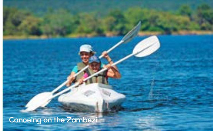
Canoeing on the Zambezi

Looking for a Victoria Falls activity with a difference? Join Makora Quest for an amazing canoe experience on the Zambezi. This activity combines the exquisite tranquility of the Zambezi River, with the exhilarating thrill of authentic Africa like no other Victoria Falls activity. Accompanied by a professional guide with many hours experience on the river, enjoy glorious scenery and birding with a choice of a Half Day, Full Day, or the amazing Overnight Canoe experience. Canoeing on the river is also an ideal fun group activity, with canoes available for up to 70 people for the Half or Full Day experience. A canoe safari on the river is truly one of the best kept Zambezi secrets a 'must-do' Victoria Falls activity.