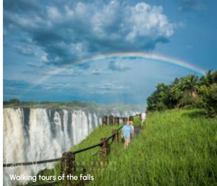
Walking tours of the falls

Chobe National Park is well known for its large herds of elephant that frequent the Chobe River on a daily basis. Apart from the herds of elephants, Chobe also has lots more to offer. The Park has lion, leopard, buffalo and a whole host of antelope like sable, puku, kudu, eland, roan and many others which you can get to see. The river is filled with big pods of hippos and some of the biggest crocodiles in Africa. This is a full day activity - leaving early in the morning and returning early evening. It includes a morning 4x4 land safari, lunch at a local hotel and then an afternoon boat-based river safari.