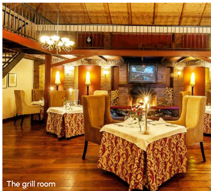
The grill room

Located adjacent to the swimming pool, Peaberries offers a range of spa treatments. The ideal place to relax and unwind.