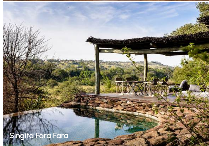
Singita Faru Faru