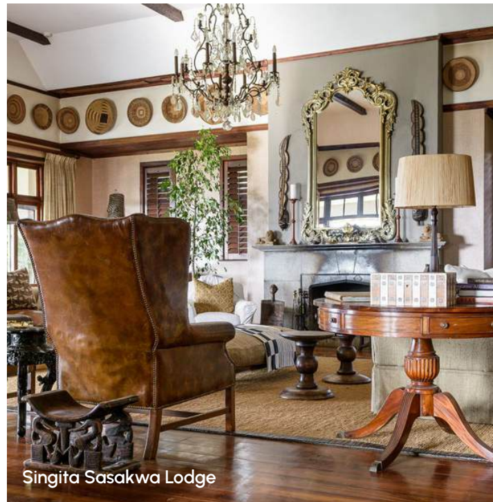
Singita Sasakwa Lodge

The main lodge area offers a dining room, bar lounge with satellite television, DVD player and library, outdoor barbeque area and The Singita Shop. The viewing decks overlooking the waterhole are positioned alongside the heated swimming pool.